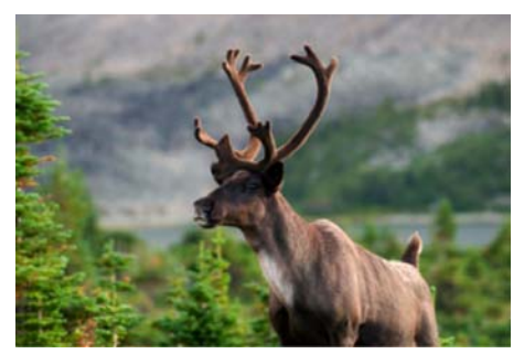
Figure 1. Woodland caribou